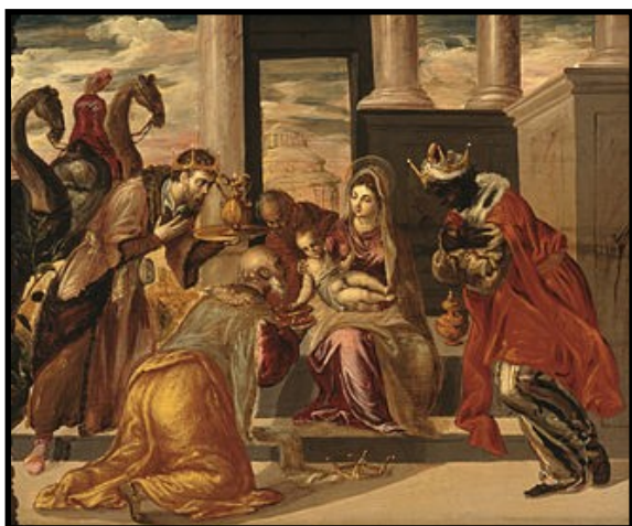
Adoration of the Magi (1568). Museo Soumaya, Mexico City. Completed between between 1568 and 1569 Public domain