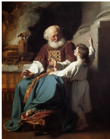
Depiction of Eli and Samuel by John Singleton Copley, 1780.