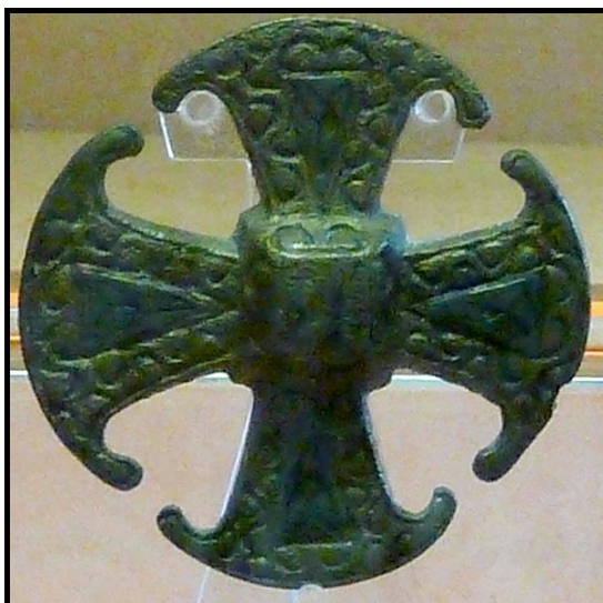
The original Canterbury Cross which is on permanent display at Canterbury Heritage Museum, Canterbury, Kent, England. Dated circa 850 AD, made of Anglo-Saxon bronze. Storye book, CC BY-SA 2.5 < https://creativecommons.org/licenses/by-sa/2.5 >, via Wikimedia

© 1978 Sarah Vaughan Lewis [Revised & © 2024 by Revd Sarah V Lewis]