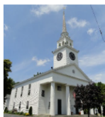
First Parish Billerica Unitarian Universalist

B ILLERICA A DVENTURE S ERIES C ORPORATION