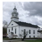
First Congregational Church in Billerica