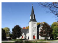
North Billerica Baptist Church