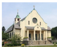
St. Matthew the Evangelist Parish St. Andrew's Church